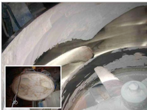
Massive dryblend deposits at vessel wall and lid due to insufficient dehumidification

Rise in processability and product quality – drop in costs