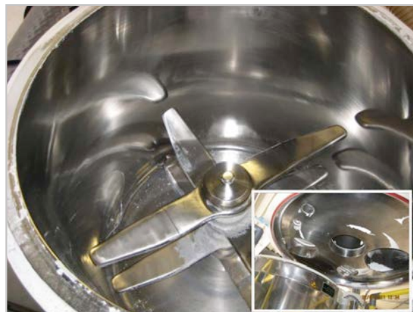
Optimum mixer interior when using MTI technology

During the mixing process of plastic products with temperatures considerably above the boiling point of water even low moisture contents will lead to troubles within the production process. The long-time field-tested and well-proven aspiration system developed by MTI reduces the moisture content of dryblends during the mixing. The remaining non-critical content has no impact on the process parameters and the product quality. The system can also be used to upgrade mixers of earlier MTI lines or other brands.