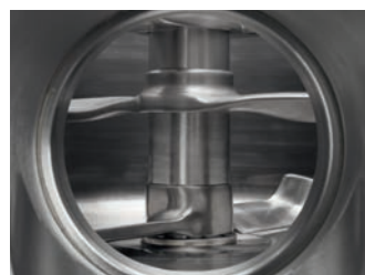
Modular mixing tool configuration