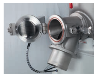
Easy to clean