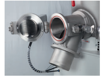
Easy to clean