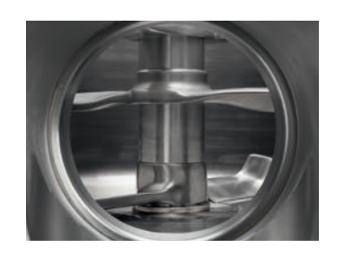
Modular mixing tool configuration