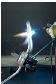
Enhanced wear protection