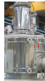
Double jacket with and without insulation