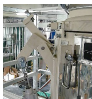
Pneumatic lid locking device