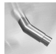
Lance in the vessel wall or lid with special design nozzle to prevent dripping