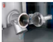
Alternative and additional discharges