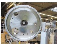
Lid lifting device with tilting mechanism