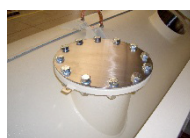
Additional inlet sockets, variable in size and position