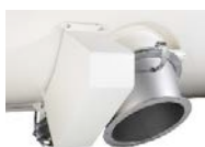
Mixer equipped with additional discharges