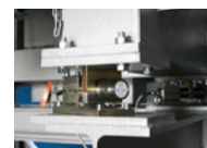
Mixer on load cells, e.g. for control of the discharge rate