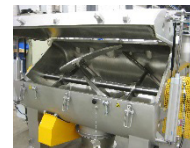
Double jacket made from stainless steel