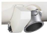
Mixer equipped with additional discharges