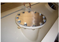
Additional inlet sockets, variable in size and position