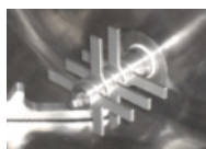
Chopper to optimise the process