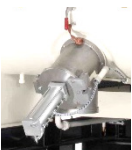
Alternative discharge design – for any situation