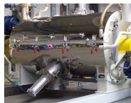
Insulation of all cooled vessel plates